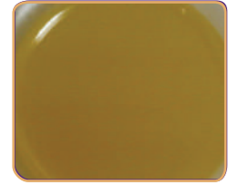
Rilefast CE Spray suspension