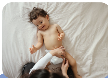
Useful for every diaper change