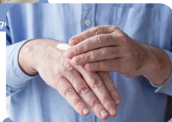
Ideal for elderly people